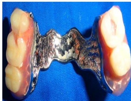
Fig. 8: CPD Occlusal surface