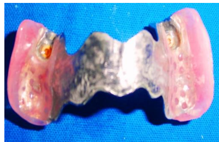
Fig. 7: CPD Intalagio surface with 'O' ring

The metal copings were clinically examined and the marginal fit was verified. Keeping the metal copings on the prepared teeth an pick up impression was made with monobody elastomeric impression material. An adequate interocclusal distance allowed ceramic application (Fig. 6). The dental surveyor was again used to check the previously established insertion/removal path of the CPD. The FDP/cast assembly was duplicated with reversible hydrocolloid, and a refractory cast was produced. Single palatal strap major connector was designed. The artificial teeth were selected and positioned using the interim prostheses as form and color reference (Fig. 7 & 8). O-Ring is held into the denture base acrylic (matrix portion) by a metal ring. This allows for ease in replacement of the rubber O-Rings if they are worn out in the future with minimal damage. To ensure adequate seating during FDP cementation, the prostheses were attached extraorally, and glass ionomer cement was used. This procedure must be carried out when attachments are used for the association of an FDP/RPD, because a minimal error during FDP cementation may compromise the oral rehabilitation. (Fig. 9)