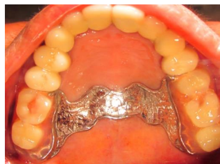
Fig. 9: FPD with Precision Attachments