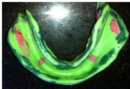
Fig. 10: Lower Final Impression